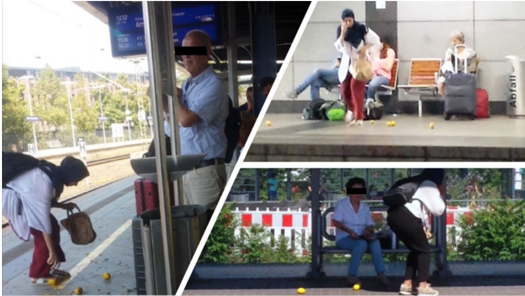
Figure 1. Experiment in action.

helping behavior toward ingroup and outgroup members in an experimental design that is itself a measurement strategy focused on identifying the effect of temperature on behavior while abstracting from other possible causes of discrimination.